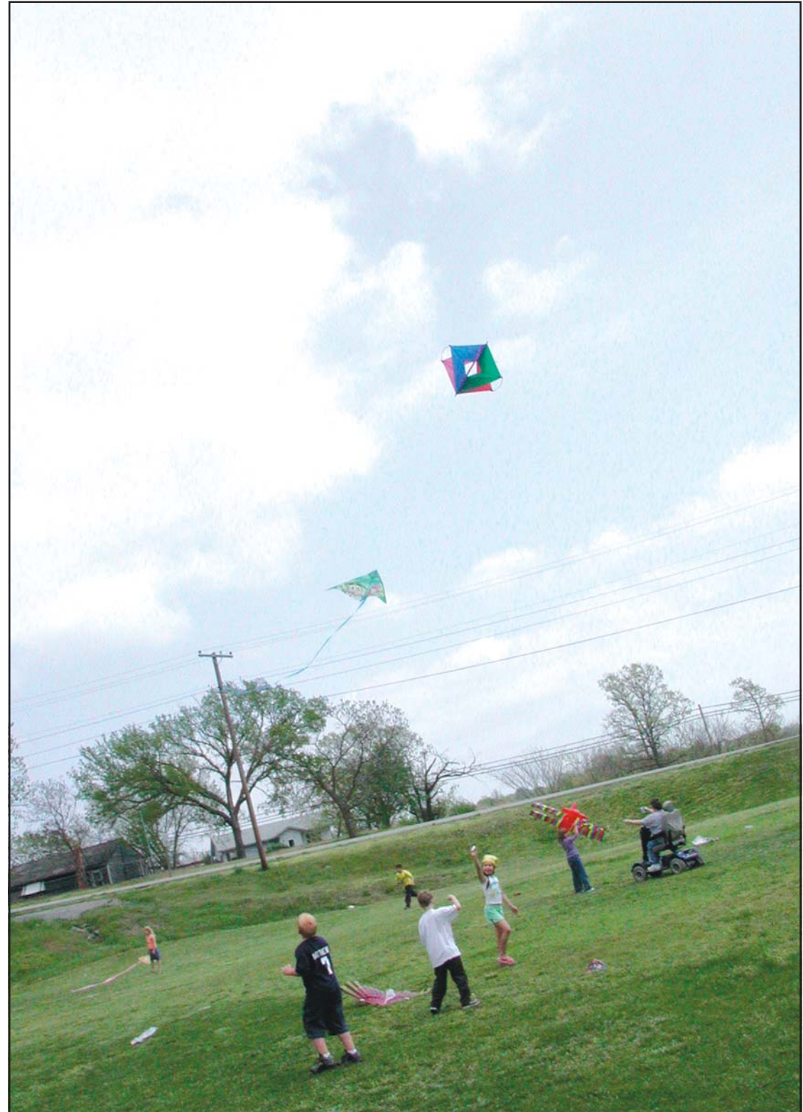
Spring Grove students made it out to the City Park Wednesday to fly kites and enjoy the good weather.

President George W. Bush created the President's Council on Service and Civic Participation in 2003 to help recognize the valuable contributions volunteers are making to our Nation. Chaired by two-time Super Bowl champion Darrell Green, with former U.S.