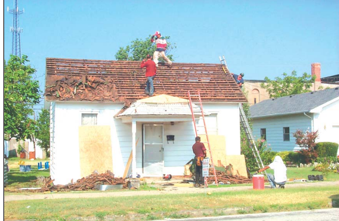
Repairs are still in progress around the area from the storm June 30.

Bob Shryock expressed the opinion that the fence at the old tennis court should be taken down to make room for more parking and he wants input from the residents on the subject.